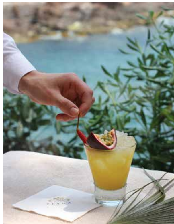
A FESTIVE EVENING Sunset drinks in our gardens