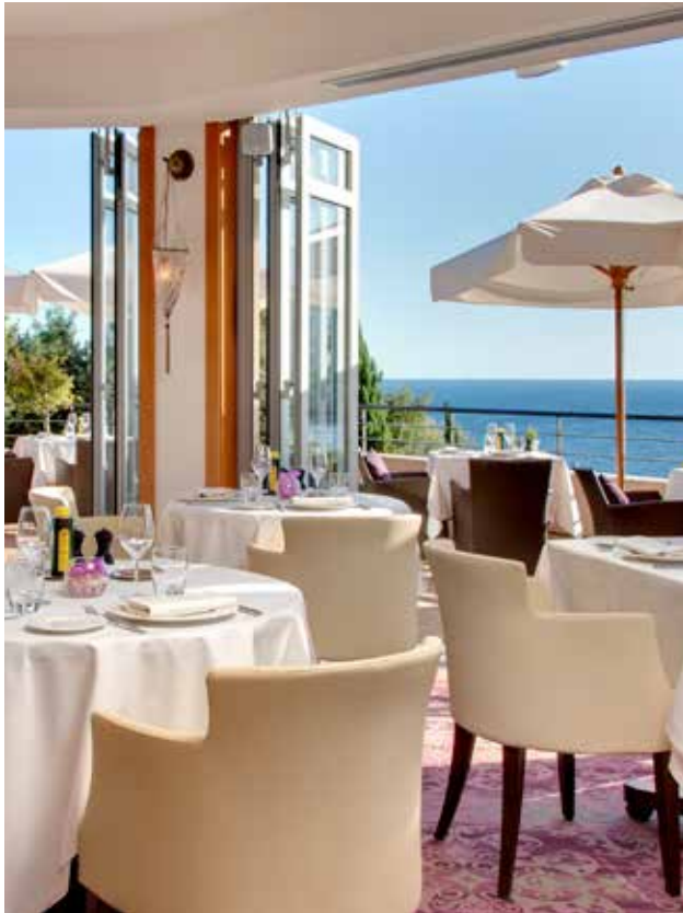
A magical wedding in an exclusive place