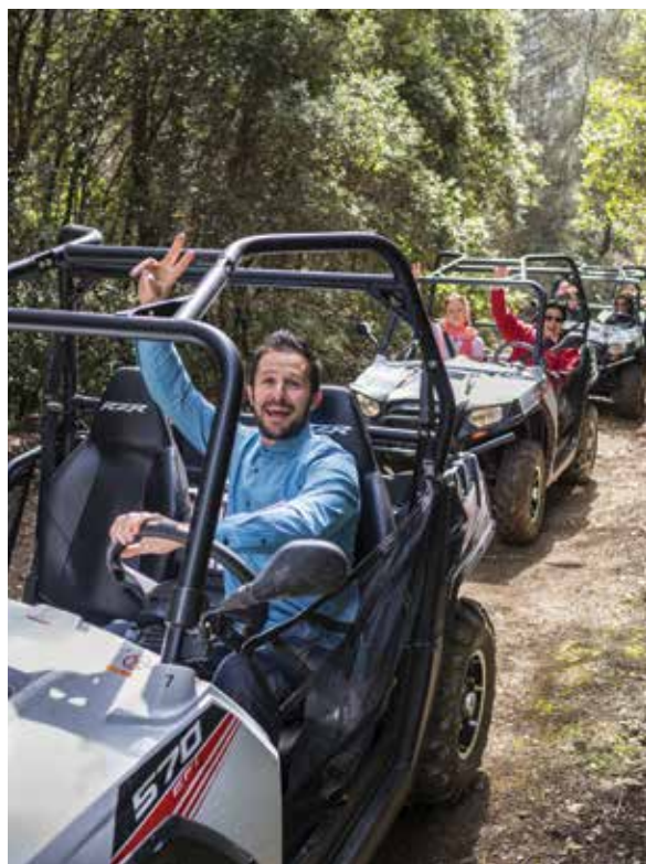
MORNING ACTIVITIES BUGGY Ride to discover the coastline