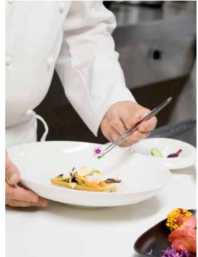
Our chef is at your service to customize the menu to your taste