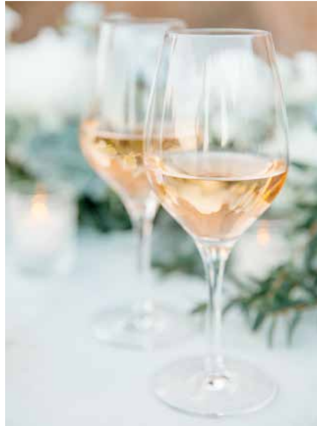
Your welcome reception in our blooming gardens