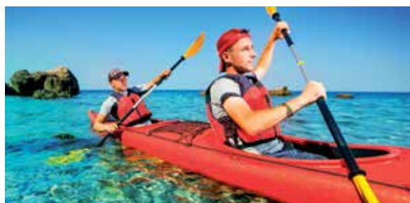
A SPORTY AFTERNOON A 180 minutes race made of 4 challenges