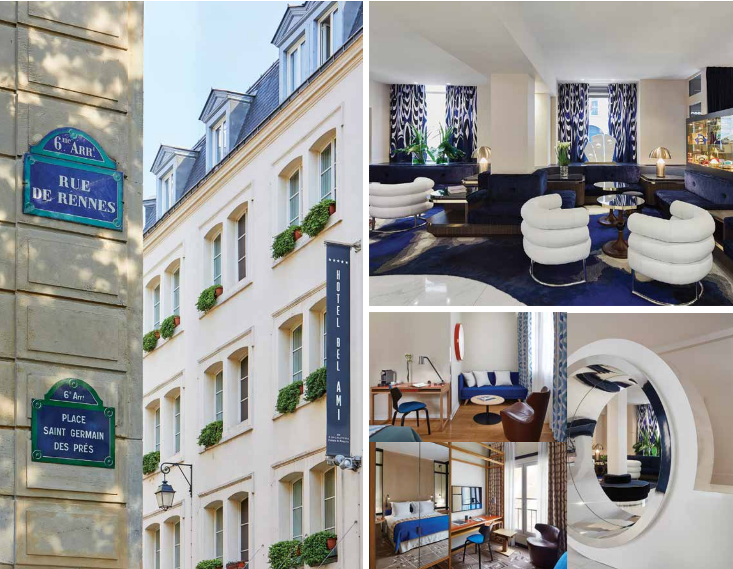
Hôtel Bel Ami, Saint-Germain-des-Prés: ‘the place to be’.