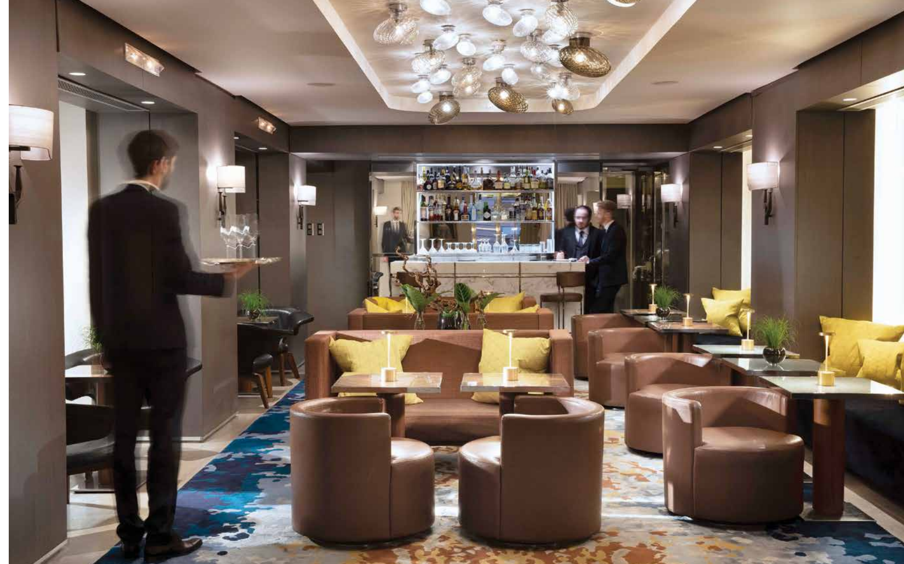
Hôtel de Sers, the 19th-century home of the Marquis de Sers.