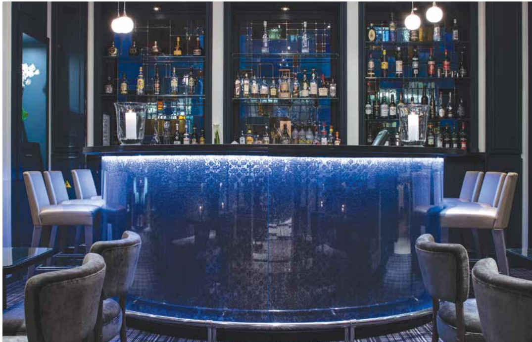
The intimate, atmospheric bar at Hôtel Édouard 7.

known as Bertie – a bon vivant whose colourful life pursuing high-class courtesans in Paris led him to be known as Dirty Bertie. Housed in a classic Haussmann-style building, 70 per cent of the hotel's rooms have balconies, many with direct views to the Opéra Garnier, just two blocks away. Literally around the corner from the Place Vendôme with its plethora of jewellery stores, the décor on each floor pays homage to a different gemstone.