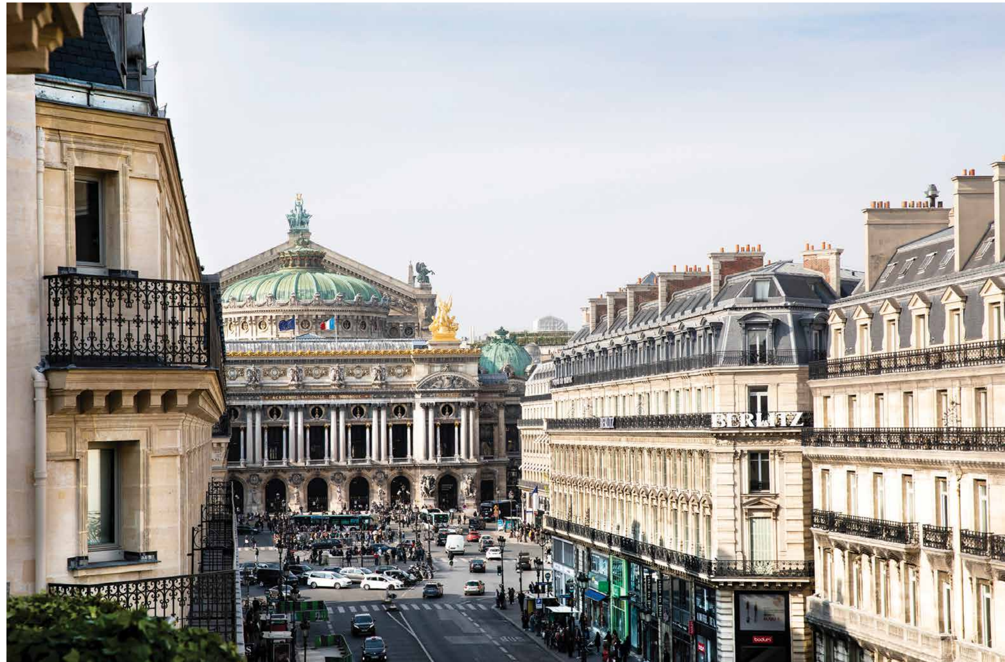
ABOVE: Hôtel Édouard 7, on Avenue de l'Opéra, once the Paris residence of the Prince of Wales. BELOW: Gemstone-themed rooms at Hôtel Édouard 7.

But there was a pattern forming here. Every two years, the group would add another property. The next two were located in the heart of the 'Golden Triangle', just metres from the Champs-Élysées.