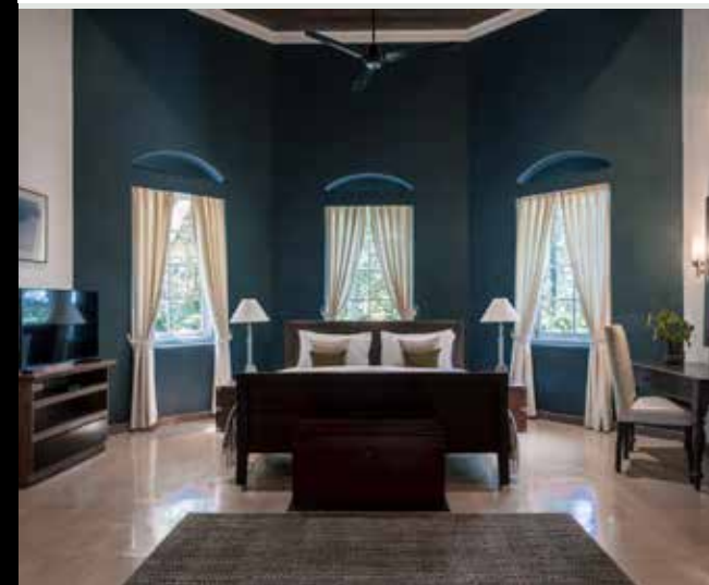
Left and top: colonial style rooms and forest views at Glenross, Sri Lanka. Right and above right: a Greek idyll at Phaea Blue Palace, Crete

Although just 45 minutes from the coast, this boutique hotel of just 10 rooms in the untouched Kalutara Highlands of Sri Lanka's interior is the perfect place for a wellness pit stop. The comfortable rooms are decorated in a soothing palette of navy, green, ochre and taupe, which perfectly complements the verdant landscape that surrounds them. Once a cinnamon, tea and rubber estate, stay in the colonial-style bungalow or, our favourite, one of the modern pool villas with an infinity plunge pool, floor-to-ceiling windows and sun deck that's just the place for a morning cup of tea or sundowner. Explore or simply stay put, relaxing with yoga or in the spa, all the while following a bespoke meal plan featuring fresh, organic and locally-sourced ingredients devised by Glenross's in-house nutritionist. Rooms from £430pn half-board; glenrossliving.com