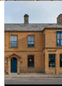
Above: Holm heroes all things Somerset. Below: enjoy panoramic views and contemporary style at Malta's Barceló Fortina