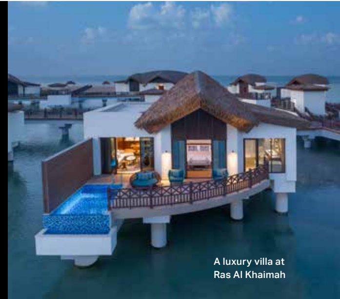
A luxury villa at Ras Al Khaimah