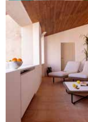
Above: Villa Paola's pool and terraces offer unrivalled R&R. Below: views of Vienna and contemporary style at The Hoxton