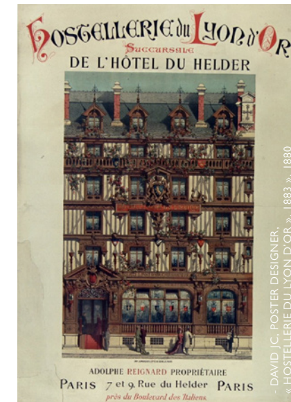
- DAVID J.C. POSTER DESIGNER, « HOSTELLERIE DU LYON D'OR », 1883 », 1880

« This restaurant is one of a kind and is one of the wonders of France's capital. Furnished and decorated in true Renaissance style, it enjoys, among travelers of all nationalities, a very great reputation for its comfort, its grandiose luxury, its exquisite cuisine, and its renowned wines. It was annexed, in 1880, to the world-famous HOTEL DU HELDER, where Apartments and Rooms can be reserved in advance by letter or dispatch. »