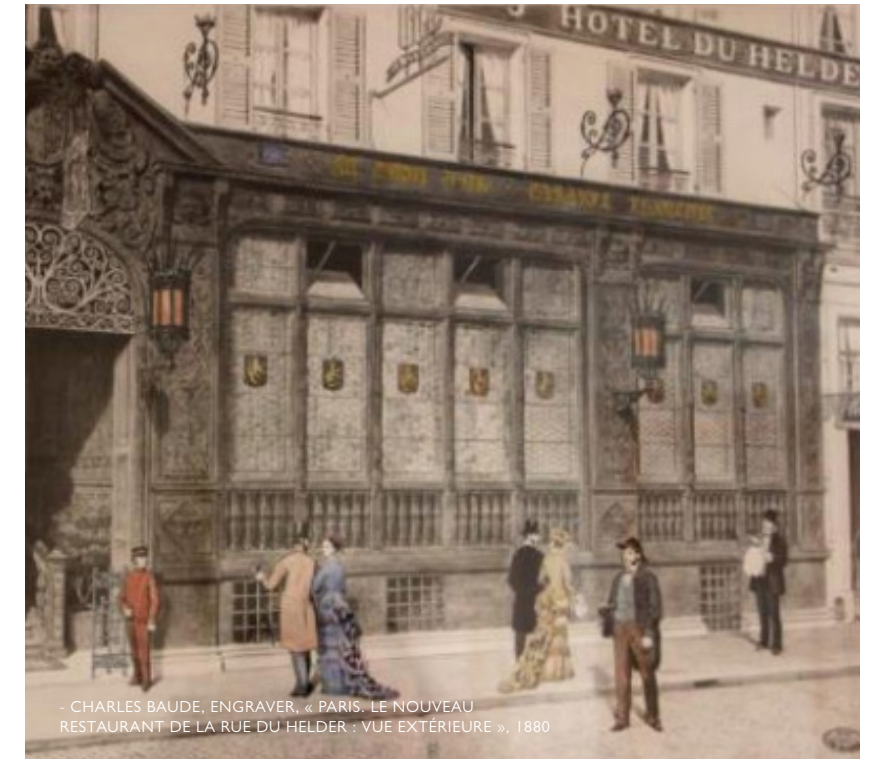
- CHARLES BAUDE, ENGRAVER, « PARIS. LE NOUVEAU RESTAURANT DE LA RUE DU HELDER : VUE EXTÉRIEURE », 1880