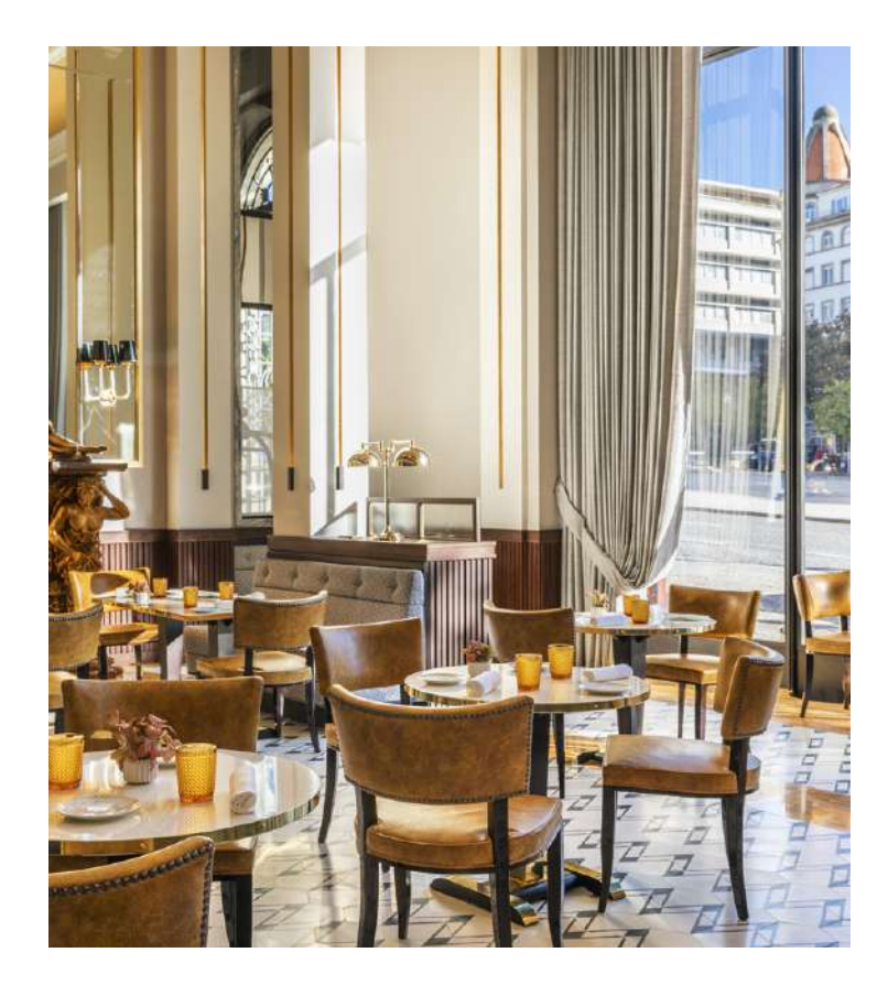
Restaurants and mezzanine can be privatized. Prices on request.