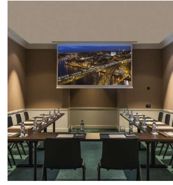
TURQUOISE MAXIMUM 22 GUESTS