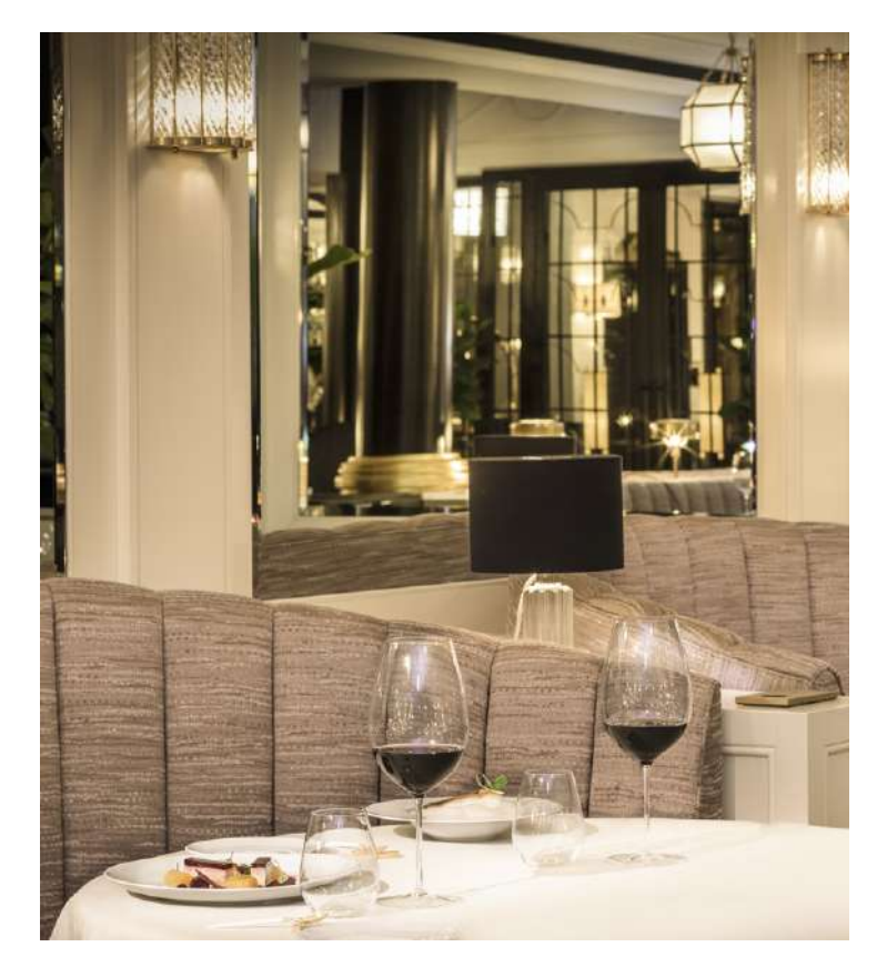
Restaurants and mezzanine can be privatized. Prices on request.