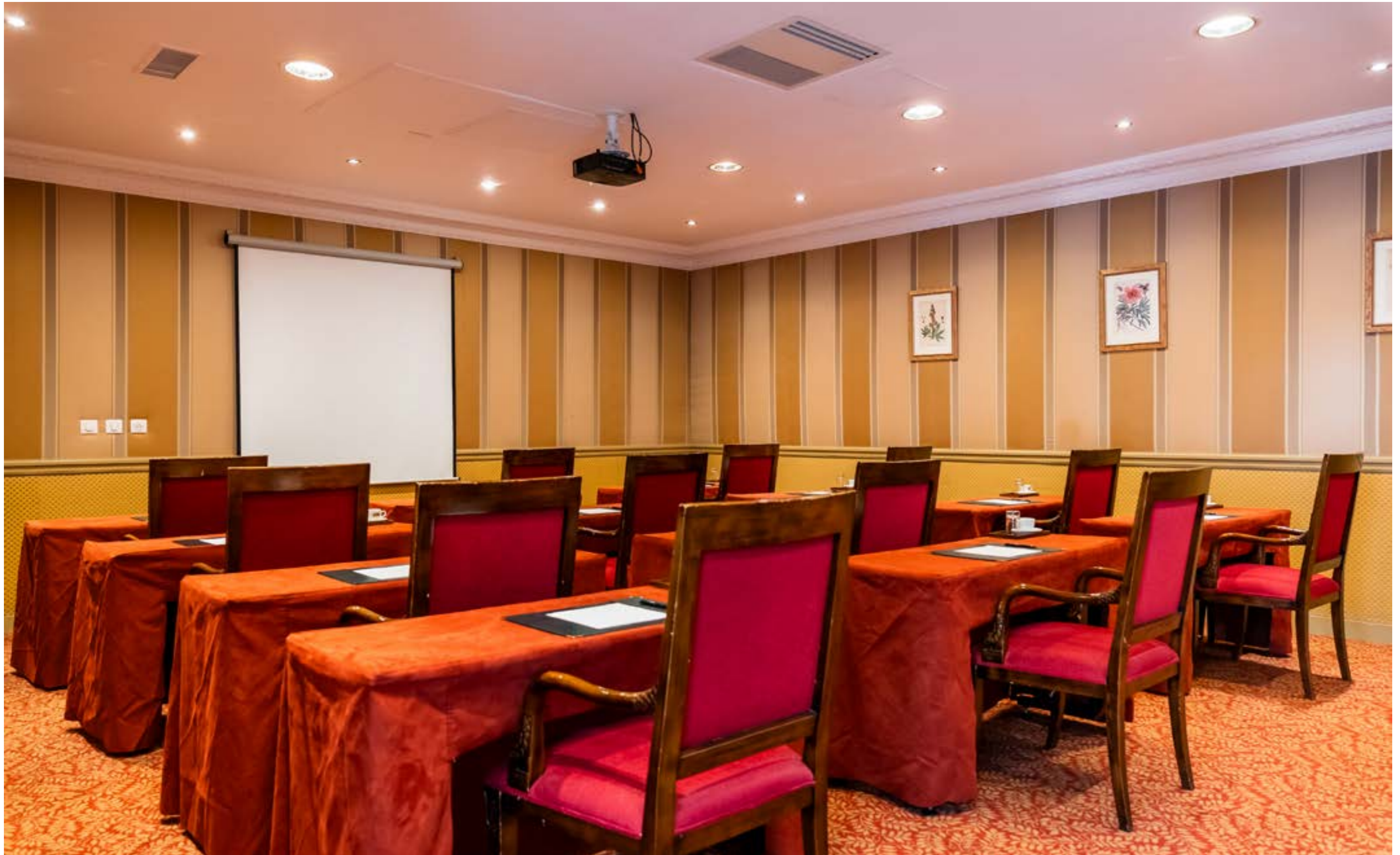
CONFIGURATION: CLASSROOM SEATS: 20