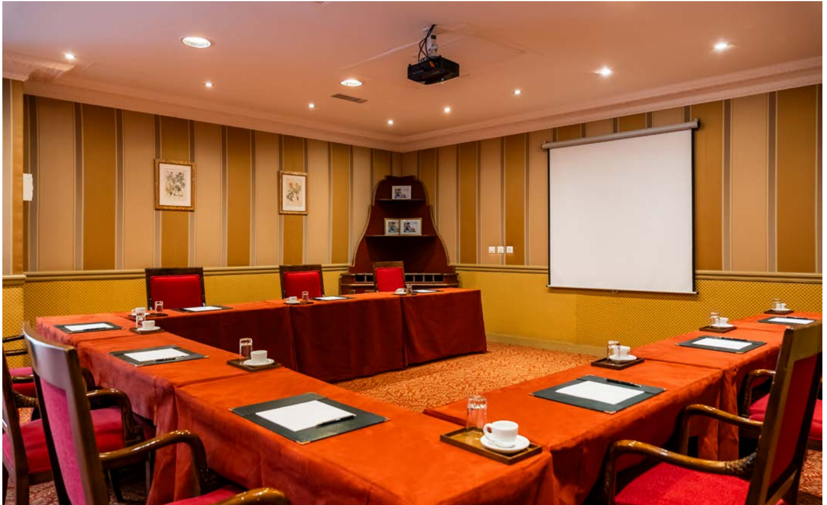
CONFIGURATION: U-SHAPE SEATS: 22