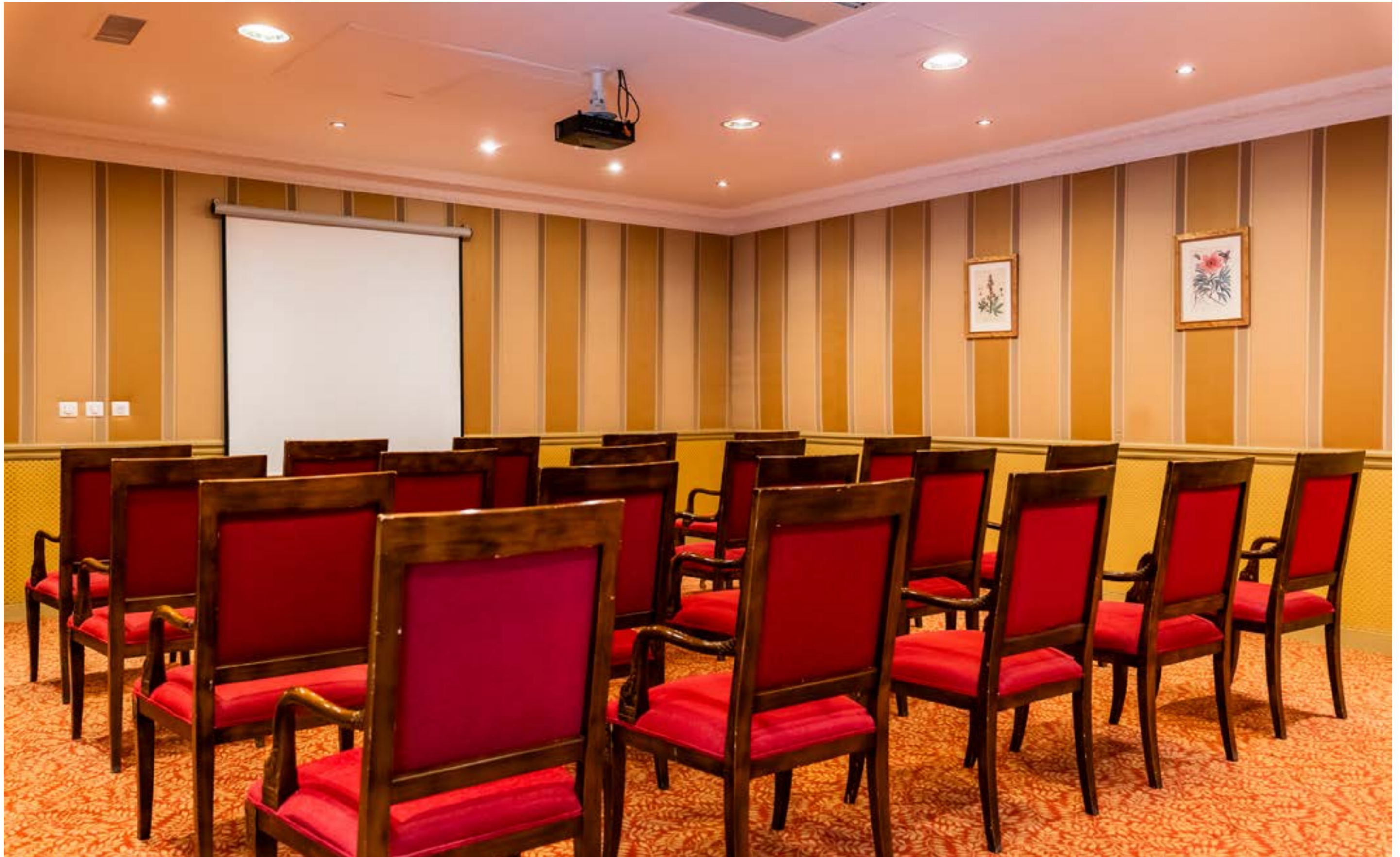
CONFIGURATION: THEATRE SEATS: 35