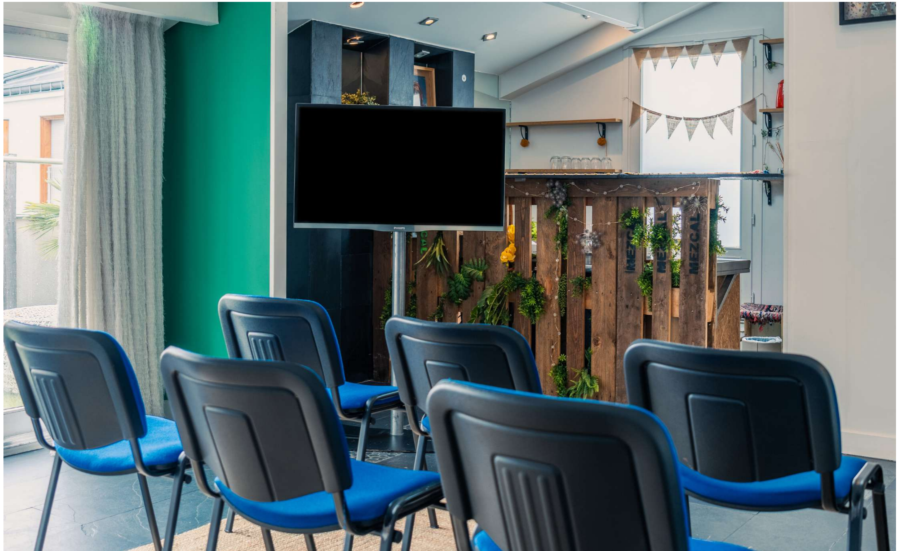
UPPER FLOOR - CONFIGURATION: THEATRE SEATS: 18