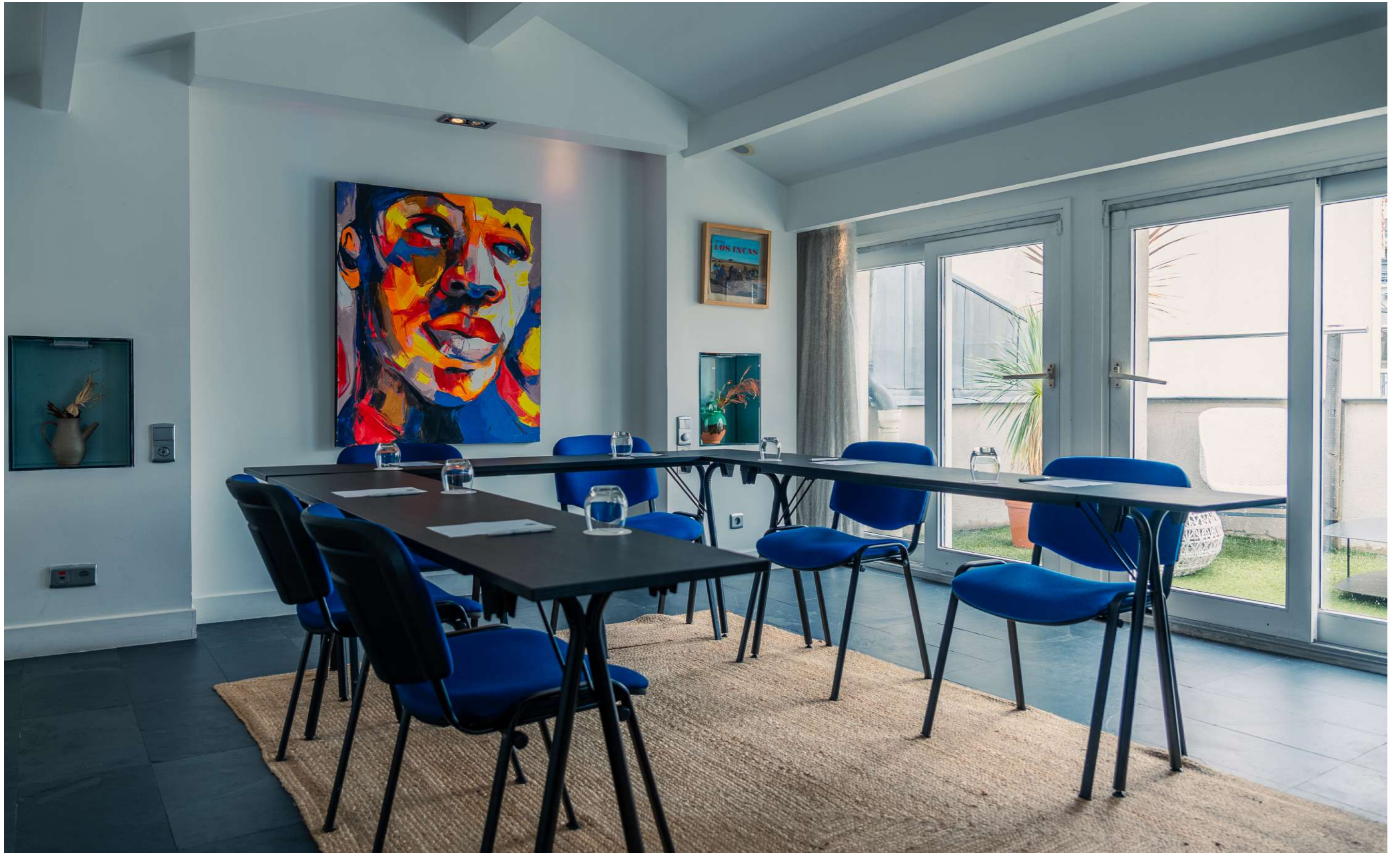
UPPER FLOOR - CONFIGURATION: U SEATS: 15