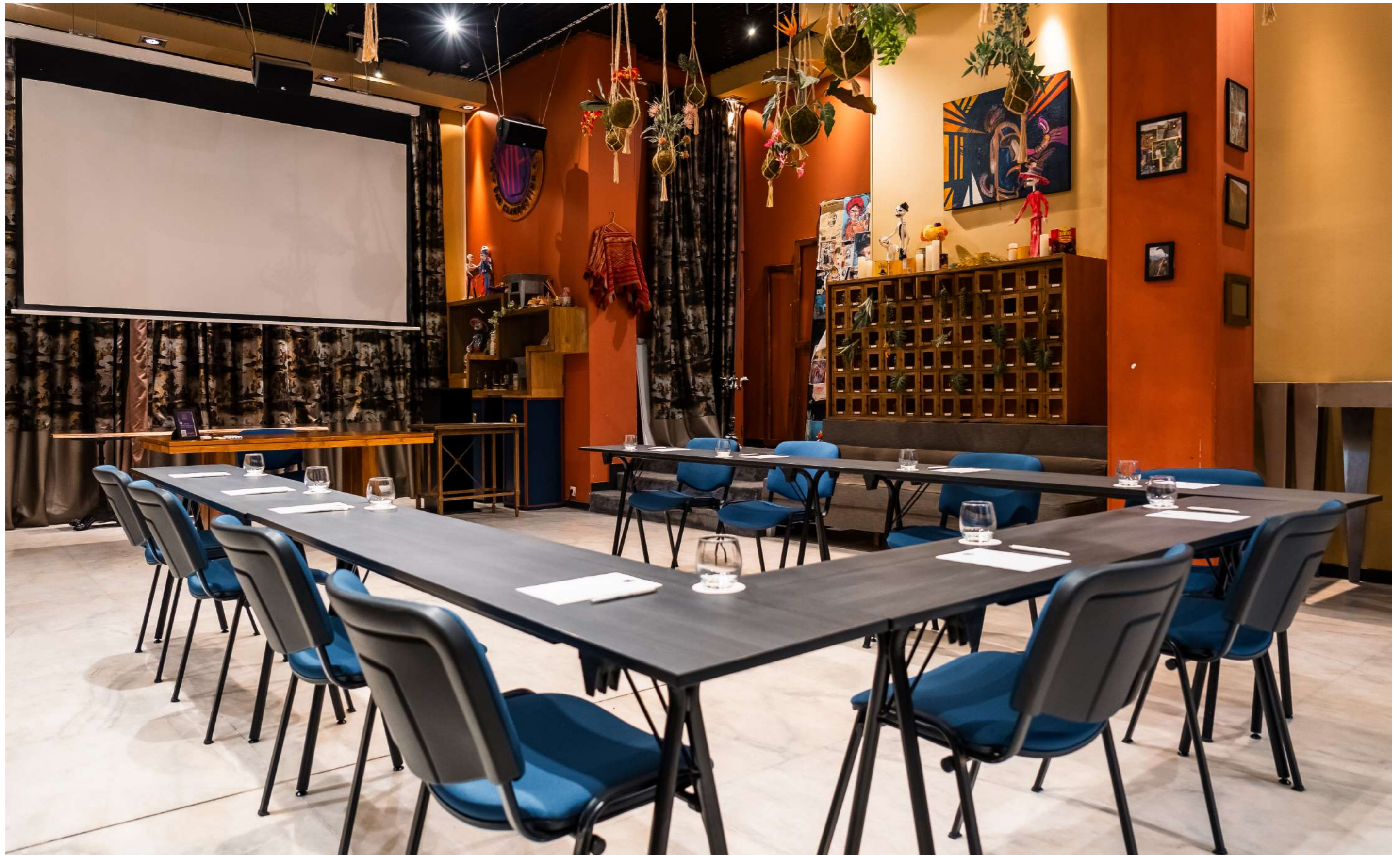
CONFIGURATION: U, SEATS: 25