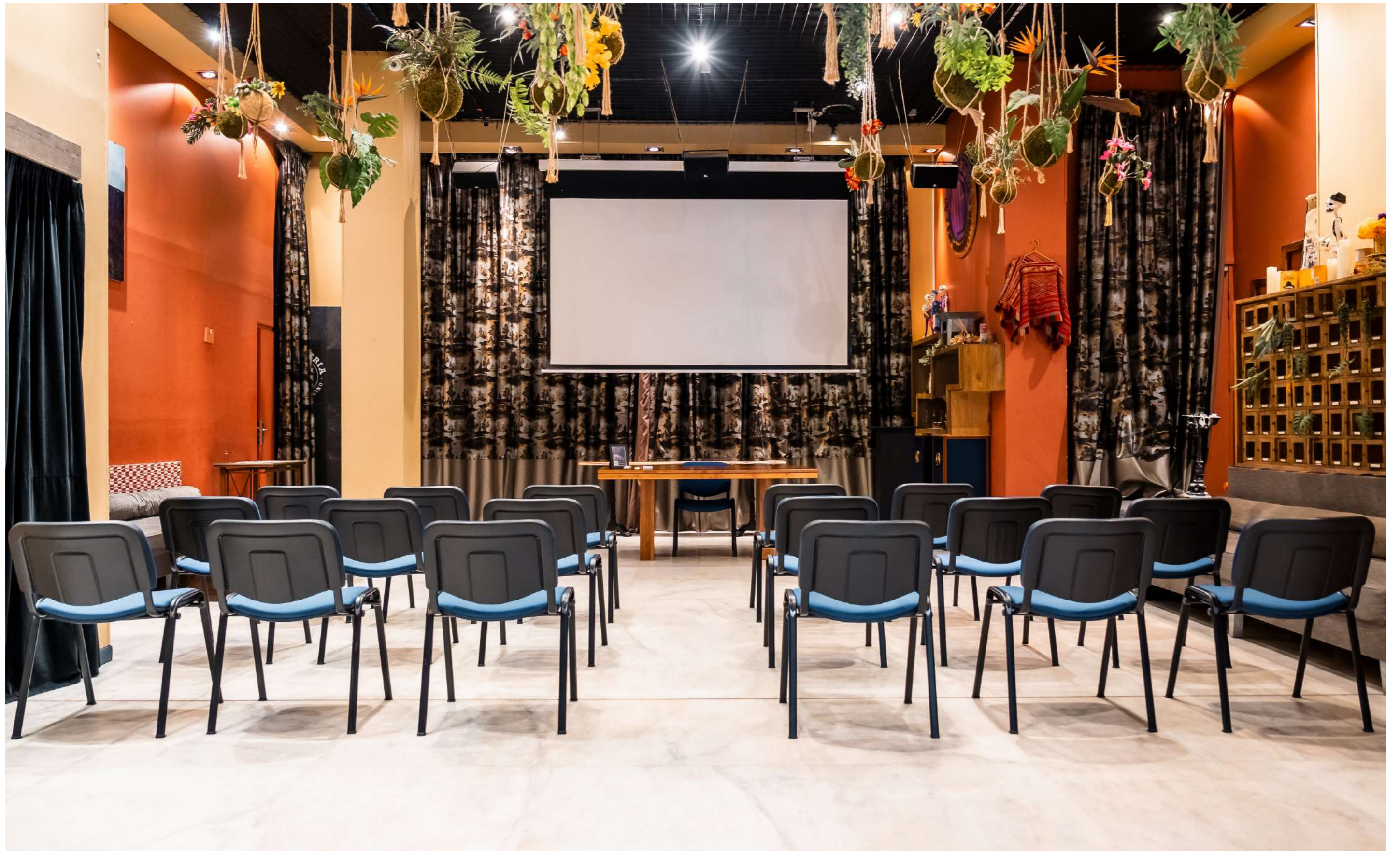
CONFIGURATION: THEATRE SEATS: 70