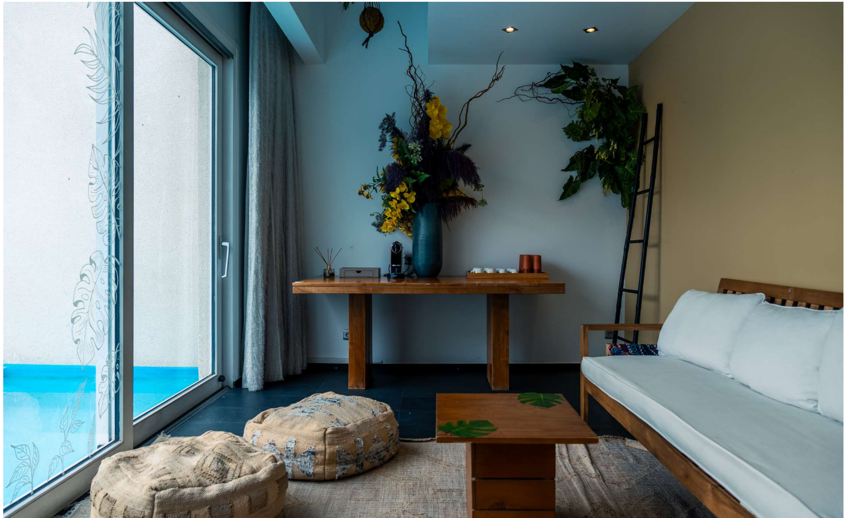
GROUND FLOOR OF THE DUPLEX SUITE