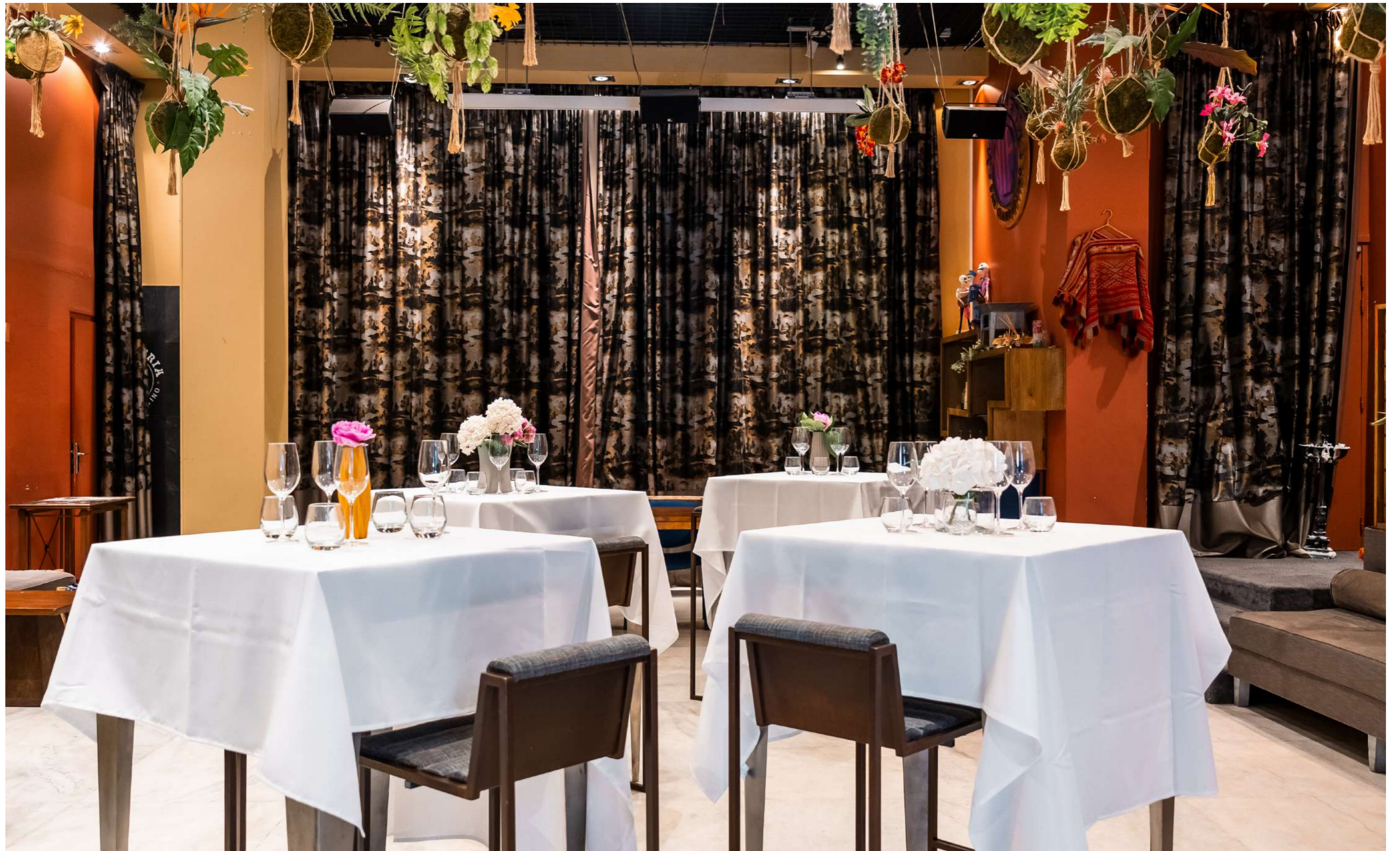
CONFIGURATION : COCKTAIL 100 PLACES