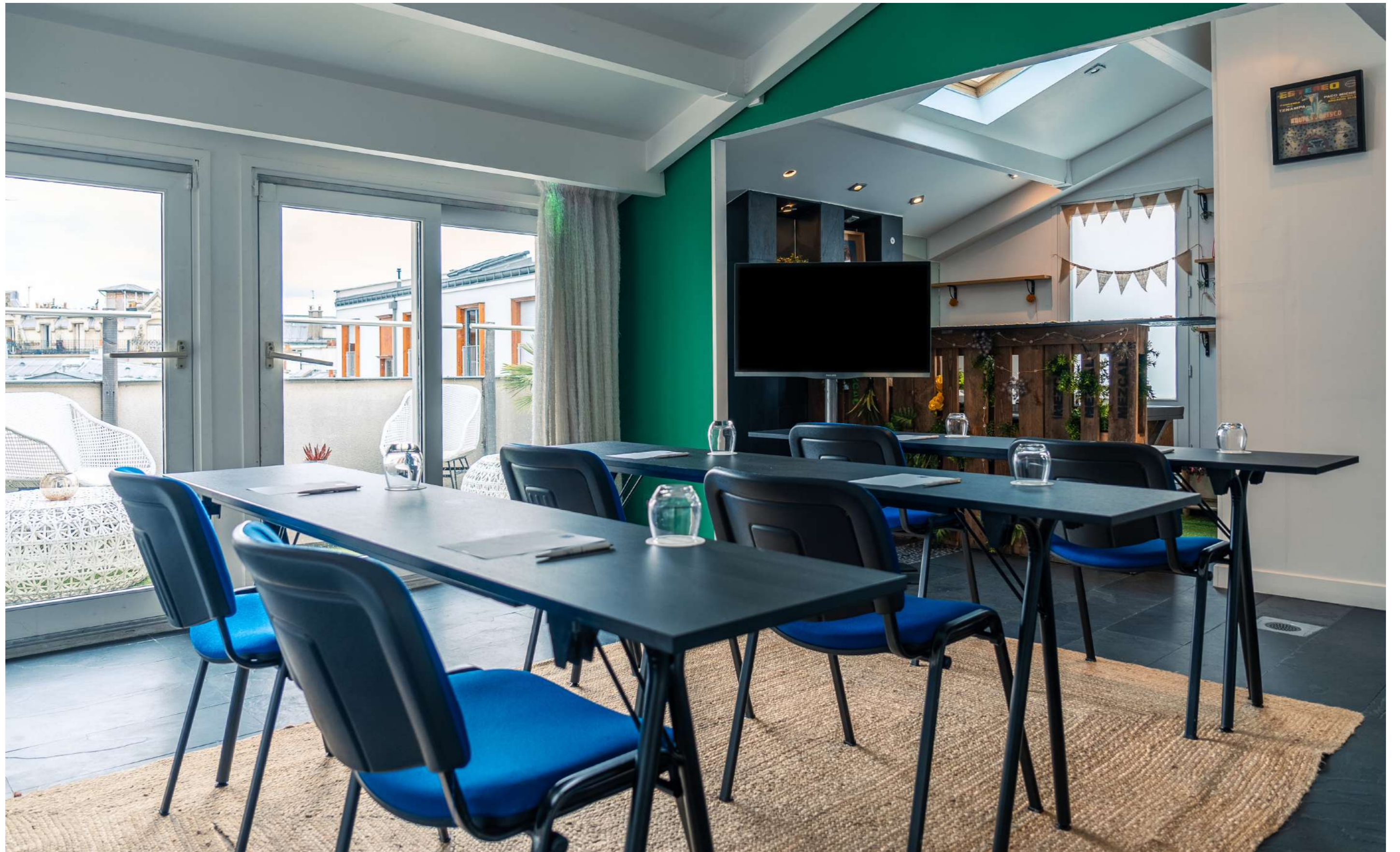
UPPER FLOOR- CONFIGURATION: CLASSROOM