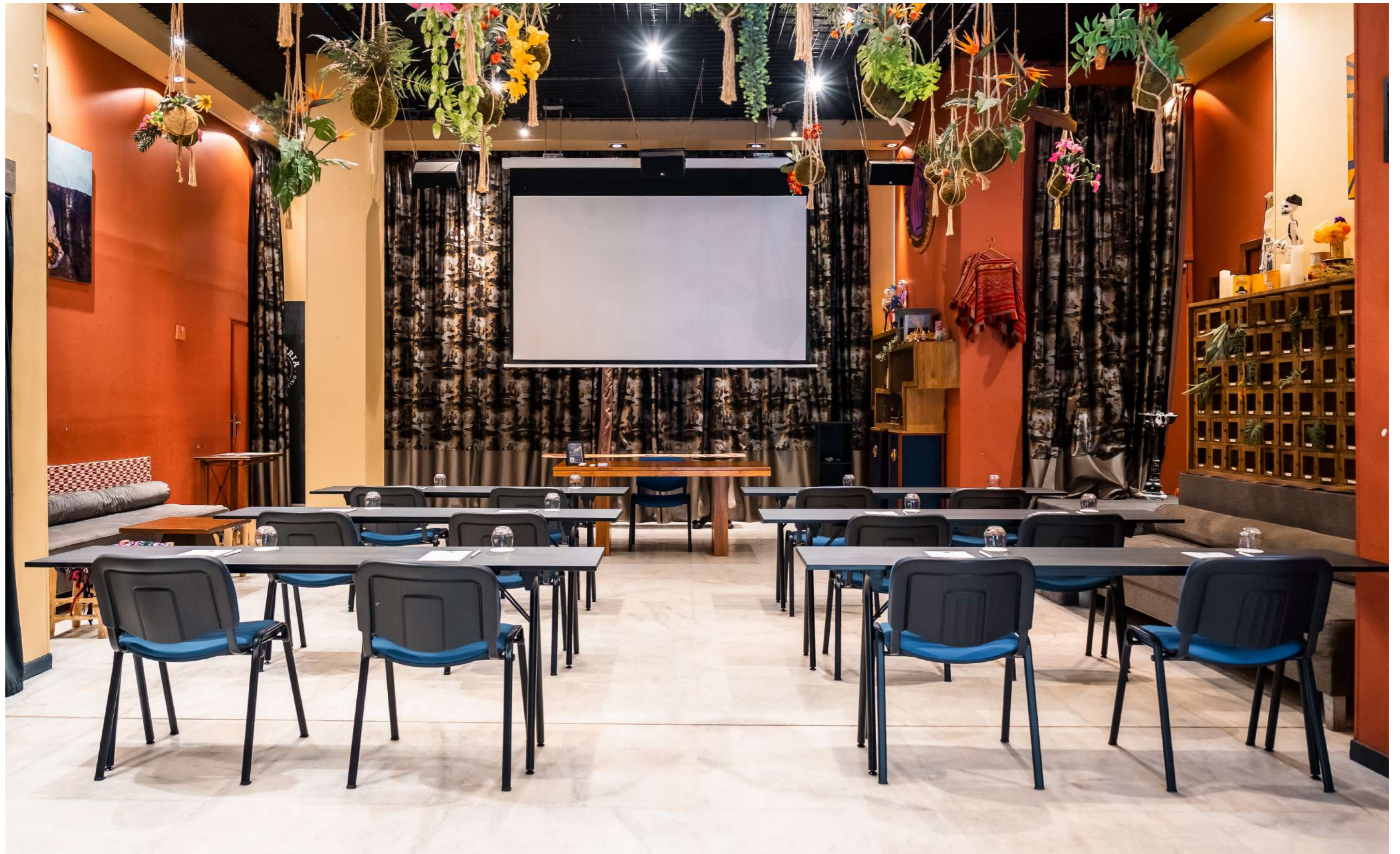
CONFIGURATION: CLASSROOM SEATS: 48