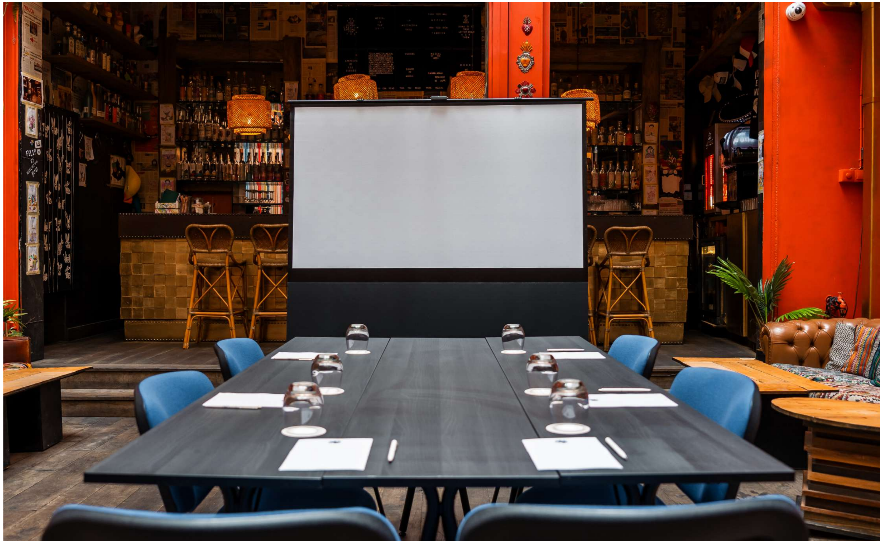
CONFIGURATION: BLOCK SEATS: 48